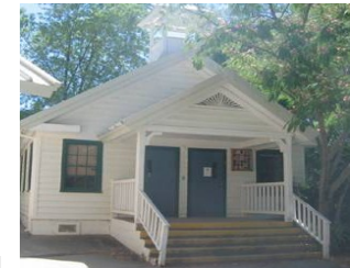
San Juan Ridge FRC Since 2005

Our mission is to connect, support, and celebrate families. We provide a